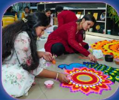
Jashan - E - Roshan