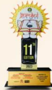
The Economic Times