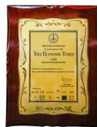
The Economic Times