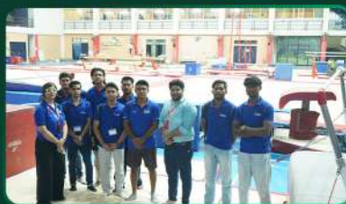
Visit at SAI 2025