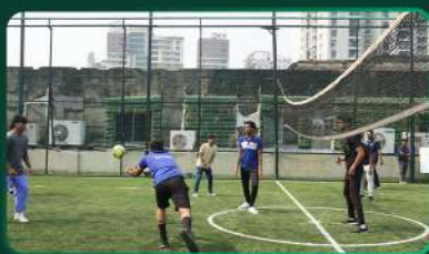
Intra Sports Event 2025