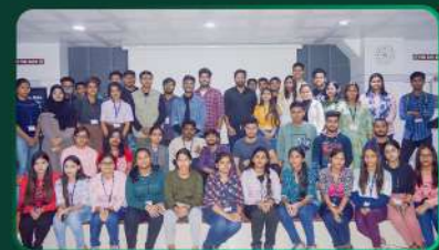
Arjuna Awardee archer Seminar