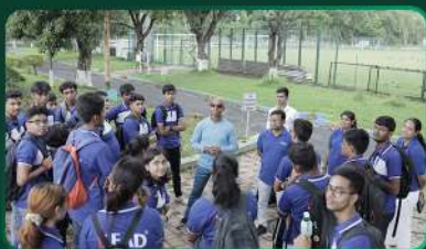
Visit at SAI 2024