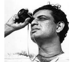
RAY on 101 st : News Inside