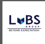
LAW AND MANAGEMENT BUSINESS SCHOOL PORT LOUIS, MAURITIUS