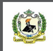
KASEM BUNDIR UNIVERSITY BANGKOK, THAILAND