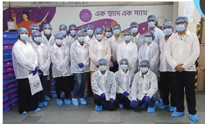
Industrial Visit to Mio Amore Factory