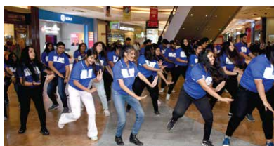
Flashmob by iLEAD Students