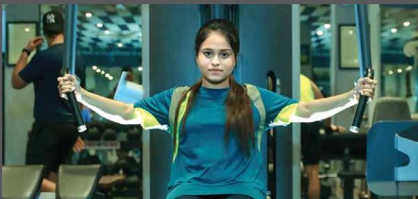
iFEEL Fitness: Gymnasium