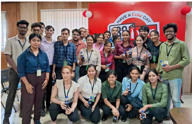
Industrial Visit to Coca-Cola Factory