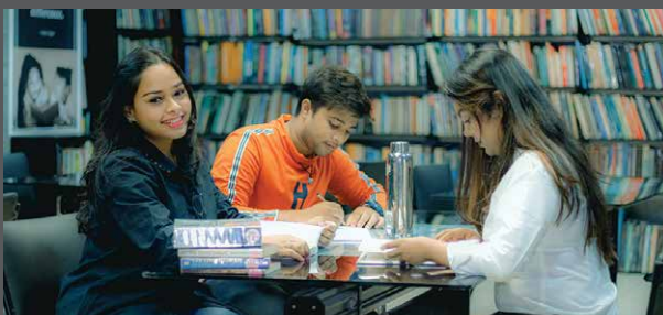
Fountainhead: iLEAD Library