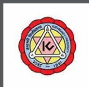
KATHMANDU UNIVERSITY NEPAL