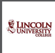
LINCOLN UNIVERSITY COLLEGE, MALAYSIA