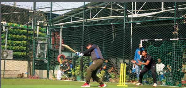
Astro Turf: Rooftop Playground