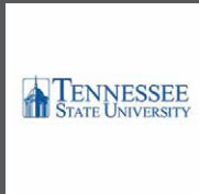
TENNESSEE STATE UNIVERSITY, NASHVILLE, USA