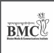
BHUTAN MEDIA & COMMUNICATIONS INSTITUTE THIMPHU, BHUTAN