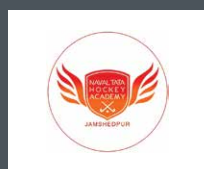
NAVAL TATA HOCKEY ACADEMY