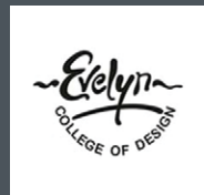
EVELYN COLLEGE OF DESIGN KENYA, AFRICA