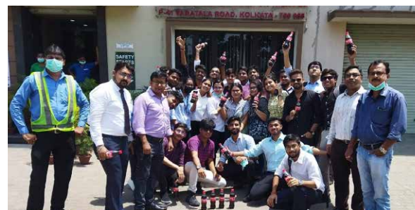
Industrial Visit to Coca-Cola Factory