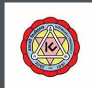
KATHMANDU UNIVERSITY NEPAL