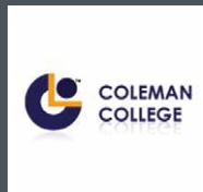
COLEMAN COLLEGE SINGAPORE