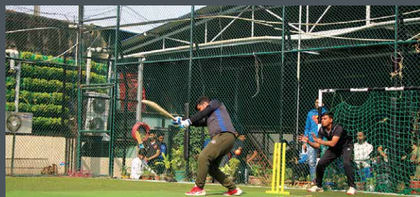
Astro Turf: Rooftop Playground