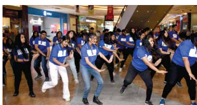
Flashmob by iLEAD Students