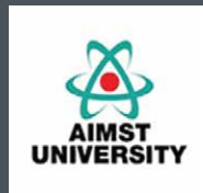
AIMST UNIVERSITY KEDAH, MALAYSIA