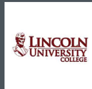
LINCOLN UNIVERSITY COLLEGE, MALAYSIA