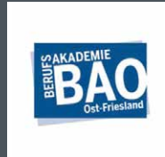
CORPORATE UNIVERSITY GERMANY