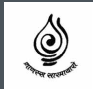
JAIN VISHVA BHARATI INSTITUTE LADNUN, RAJASTHAN