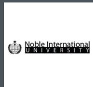
NOBLE INSTITUTION TORONTO, CANADA