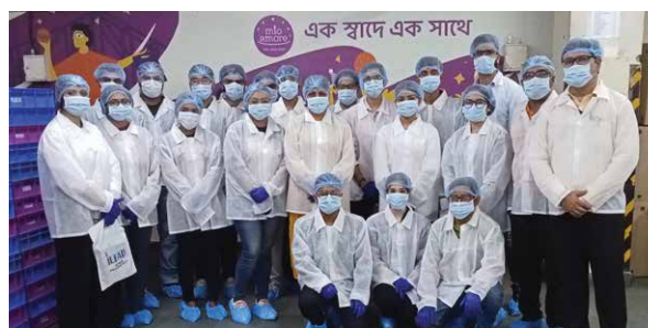
Industrial Visit to Mio Amore Factory