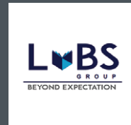
LAW AND MANAGEMENT BUSINESS SCHOOL PORT LOUIS, MAURITIUS