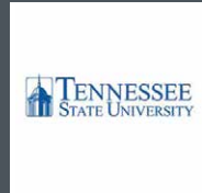
TENNESSEE STATE UNIVERSITY, NASHVILLE, USA