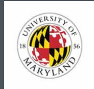
COLVIN INSTITUTE, UNIVERSITY OF MARYLAND

iLEAD also has collaborations with 16+ international universities including the Colvin Institute of Real Estate Development, USA. We have signed MOUs (Memorandum of Understanding) with numerous institutes and universities from around the world.