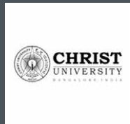
CHRIST UNIVERSITY BANGALORE, INDIA