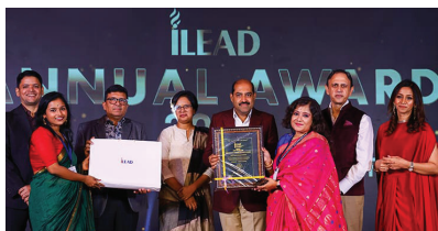
Annual Awards 2024