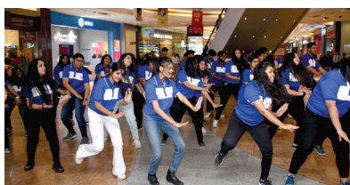
Flashmob by iLEAD Students