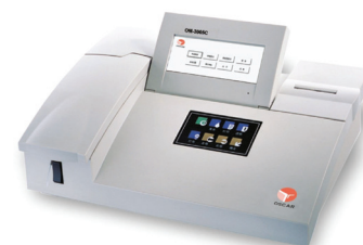
SEMI-AUTOMATED BIOCHEMISTRY ANALYZER