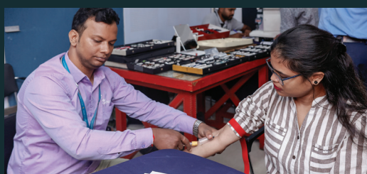
Health Camp, 2024