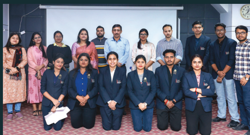
Workshop on Commercialization of Laboratory Technologies