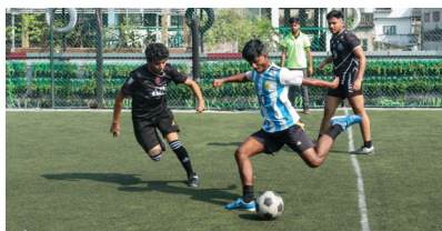
Football Tournament 2024