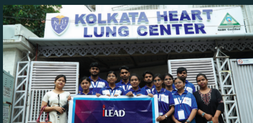
Visit to Kolkata Heart Lung Center