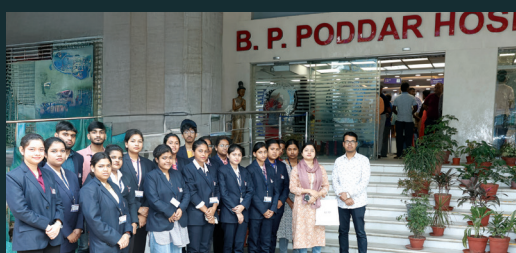
Visit to B, P, Poddar Hospital