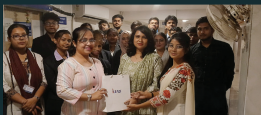
Visit to Charring Cross Nursing Home