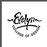
EVELYN COLLEGE OF DESIGN KENYA, AFRICA