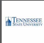
TENNESSEE STATE UNIVERSITY, NASHVILLE, USA