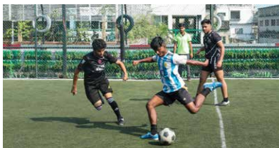
Football Tournament 2024