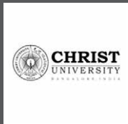
CHRIST UNIVERSITY BANGALORE, INDIA