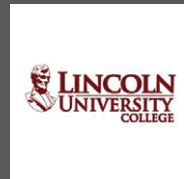
LINCOLN UNIVERSITY COLLEGE, MALAYSIA