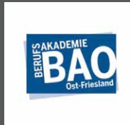
CORPORATE UNIVERSITY GERMANY