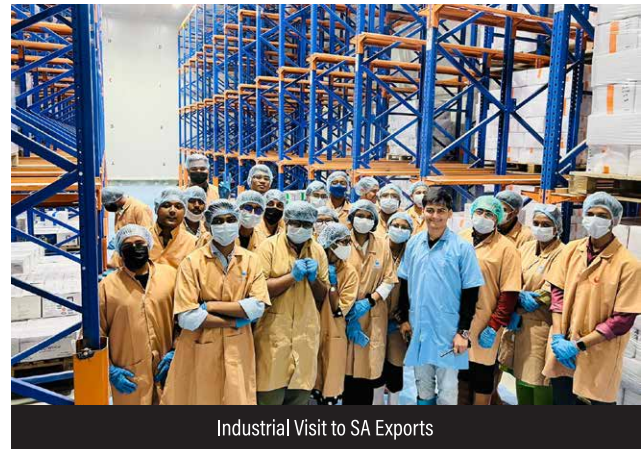
Industrial Visit to SA Exports