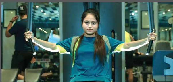
iFEEL Fitness: Gymnasium