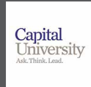
CAPITAL UNIVERSITY OHIO, USA