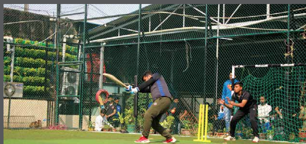
Astro Turf: Rooftop Playground