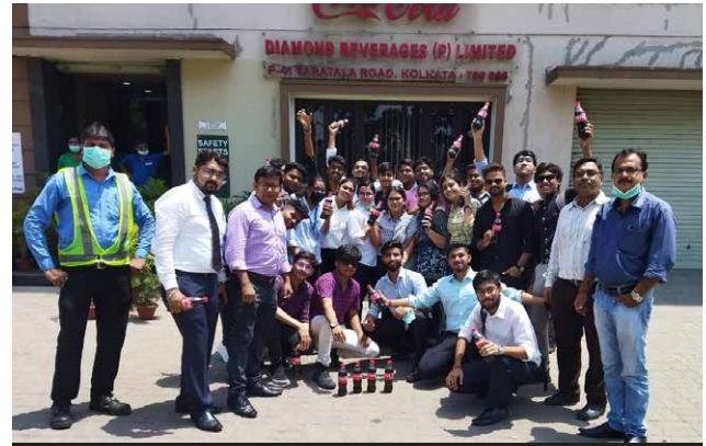
Industrial Visit to Coca-Cola Factory