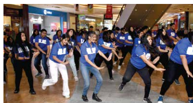
Flashmob by iLEAD Students