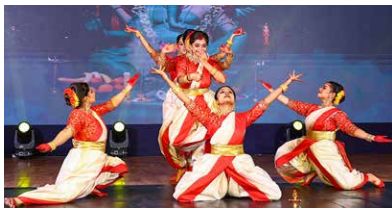
Annual Awards 2024