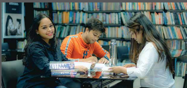
Fountainhead: iLEAD Library