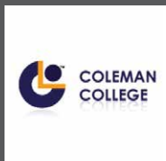
COLEMAN COLLEGE SINGAPORE