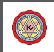
KATHMANDU UNIVERSITY NEPAL