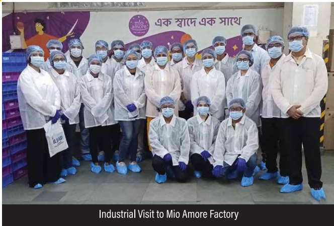
Industrial Visit to Mio Amore Factory