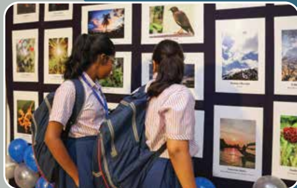
Meraki : A Photography Exhibition at iLEAD in Association with SONY India