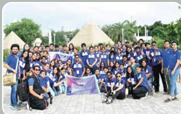
Nature Photowalk at Butterfly Garden, Kolkata