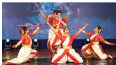
Annual Awards 2024