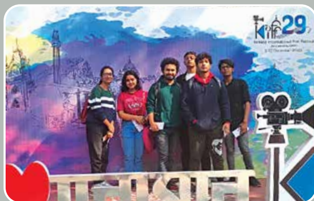
Visit to Kolkata International Film Festival 2024