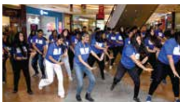
Flashmob by iLEAD Students