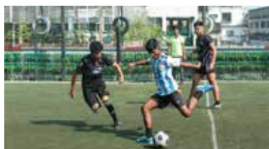
Football Tournament 2024