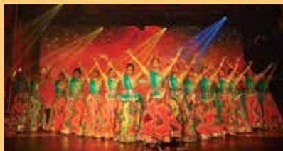
Annual Awards 2023