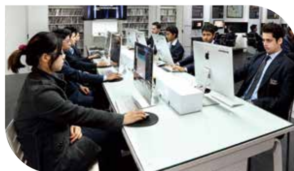
EXPLORER'S WORLD : Digital Library