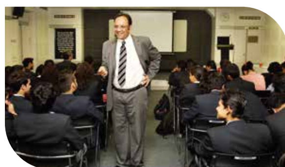
PERSONALITY DEVELOPMENT CLASS at iLEAD