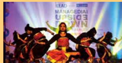
Cultural Program at Managedia