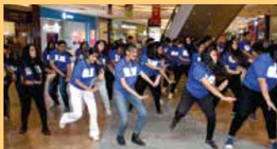
Flashmob by iLEAD Students