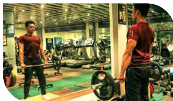
I FEEL FITNESS : The Fitness Studio