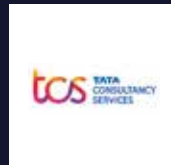
TATA CONSULTANCY SERVICES