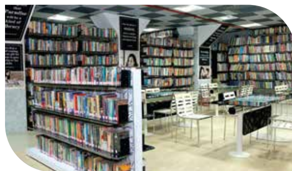
FOUNTAINHEAD : Library with over 1,20,000 Books