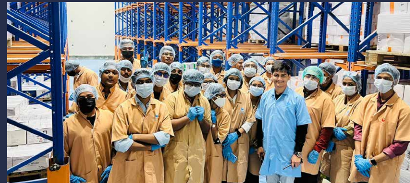
Industrial Visit to SA Exports