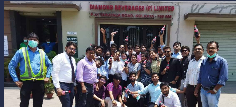
Industrial Visit to Coca Cola Factory