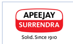
THE APEEJAY GROUP