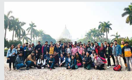
Visit to Victoria Memorial