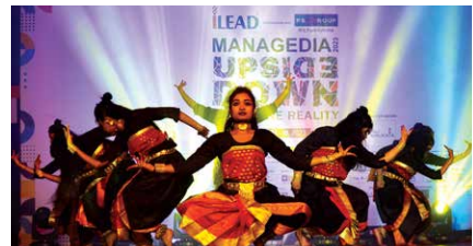
Cultural Program at Managedia