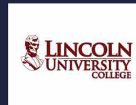
LINCOLN UNIVERSITY COLLEGE, MALAYSIA