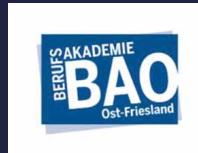
CORPORATE UNIVERSITY GERMANY