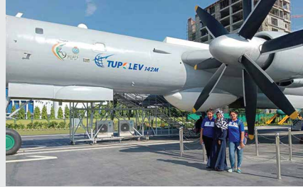
Trip to Aircraft Museum