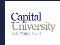
CAPITAL UNIVERSITY OHIO, USA