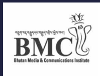
BHUTAN MEDIA & COMMUNICATIONS INSTITUTE THIMPHU, BHUTAN