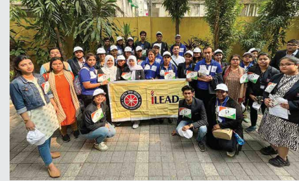
Trip to Netaji Bhawan