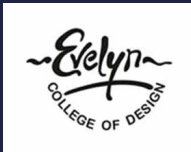
EVELYN COLLEGE OF DESIGN KENYA, AFRICA