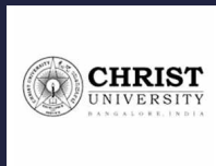
CHRIST UNIVERSITY BANGALORE, INDIA