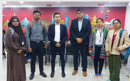
Visit to SOTC Limited