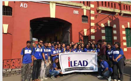
Visit to Alipore Jail Museum