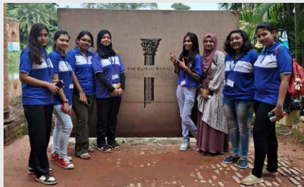
Field Trip to Rajbari Bawali