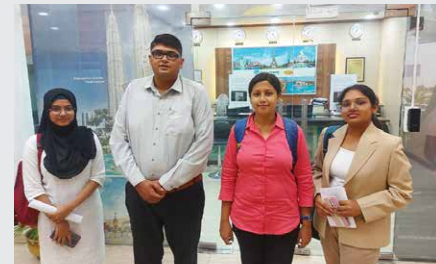
Visit to Balmer Lawrie