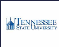
TENNESSEE STATE UNIVERSITY, NASHVILLE, USA