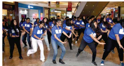
Flashmob by iLEAD Students