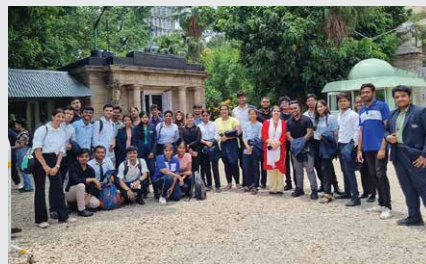
Visit to Raj Bhawan