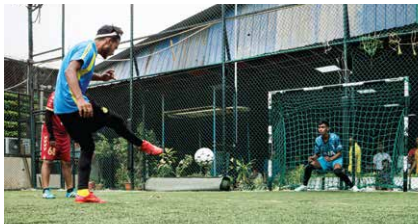
Sports Event at Managedia