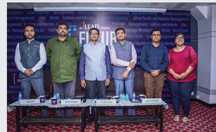
Future Vista - Session on Career Prospects in Tourism