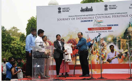
iLEAD Students Participating in Eastern Region Quiz by Ministry of Tourism at Victoria Memorial

iLEAD provides the best possible exposure to the students in the form of industrial visits and seminars. These exposures help in enhancing their practical knowledge. Some of our industrial visits and seminars include the following-