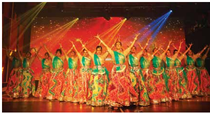
Annual Awards 2023