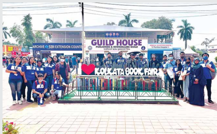
Field Trip to Kolkata International Book Fair