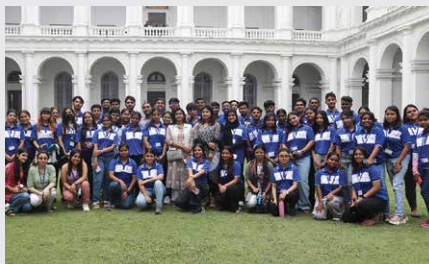
Visit to Indian Museum