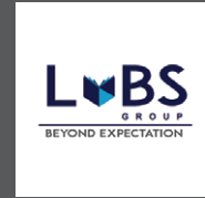
LAW AND MANAGEMENT BUSINESS SCHOOL PORT LOUIS, MAURITIUS