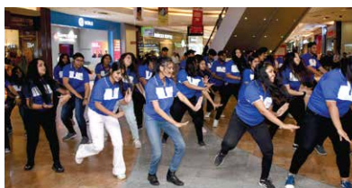
Flashmob by iLEAD Students