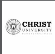
CHRIST UNIVERSITY BANGALORE, INDIA