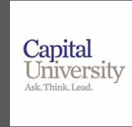
CAPITAL UNIVERSITY OHIO, USA