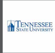
TENNESSEE STATE UNIVERSITY, NASHVILLE, USA