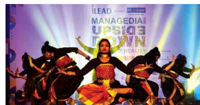
Cultural Program at Managedia