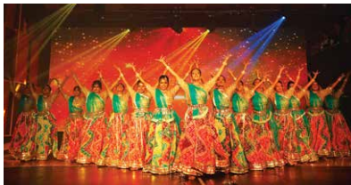
Annual Awards 2023