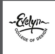
EVELYN COLLEGE OF DESIGN KENYA, AFRICA