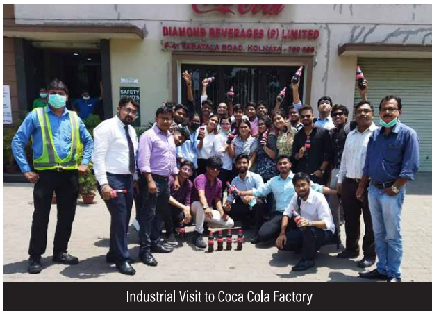
Industrial Visit to Coca Cola Factory