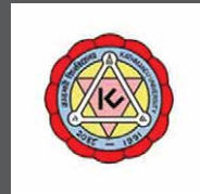
KATHMANDU UNIVERSITY NEPAL