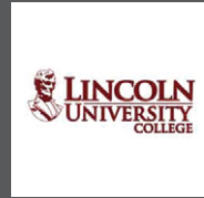
LINCOLN UNIVERSITY COLLEGE, MALAYSIA