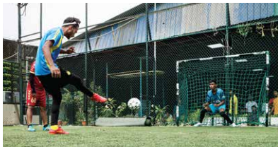
Sports Event at Managedia