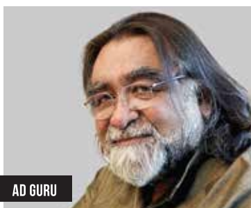
PRAHLAD KAKKAR AD GURU