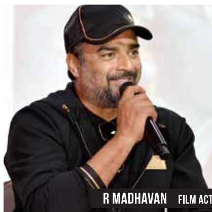
R MADHAVAN FILM ACTOR