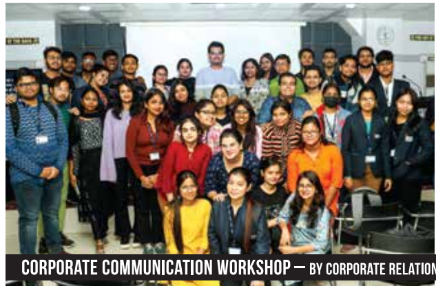
CORPORATE COMMUNICATION WORKSHOP — BY CORPORATE RELATIONS CLUB