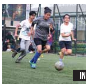
INTRA COLLEGE SPORTS