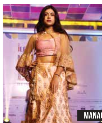
MANAGEDIA, OUR FEST