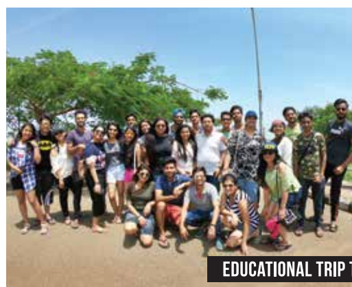
EDUCATIONAL TRIP TO VIZAG