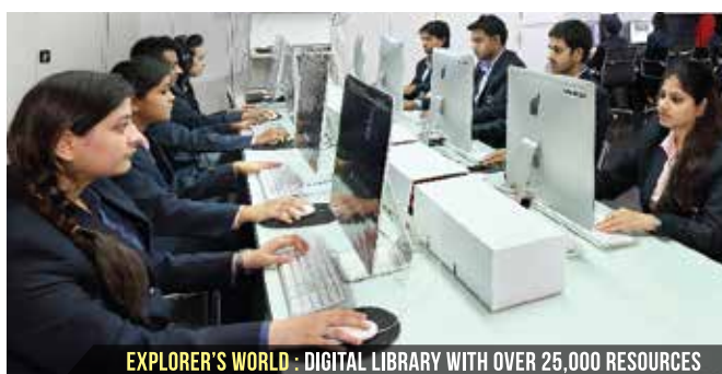
EXPLORER'S WORLD : DIGITAL LIBRARY WITH OVER 25,000 RESOURCES