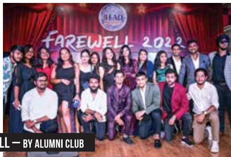
FAREWELL — BY ALUMNI CLUB