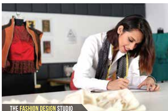
THE FASHION DESIGN STUDIO