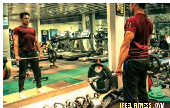
I FEEL FITNESS : GYM