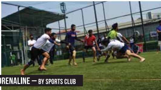
ADRENALINE — BY SPORTS CLUB