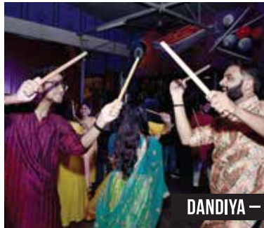
DANDIYA — BY CULTURAL CLUB