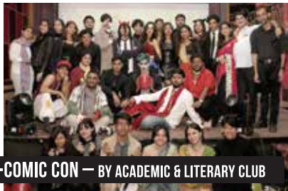
PLAYLIT-COMIC CON — BY ACADEMIC & LITERARY CLUB

iLEAD has 15 student clubs that not only uplift the spirit of the institution but also work towards holistic development of students which includes their communication skills, administrative skills, leadership skills, creativity and team work.