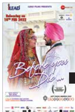
OUR FIRST FEATURE FILM

While education has always been at the forefront, we believe in the integration of co-curricular activities with academia. Rising above the graph is what makes every iLEAD student distinctive. We have various events throughout the year that boosts their motivation to be more participative and inclusive.