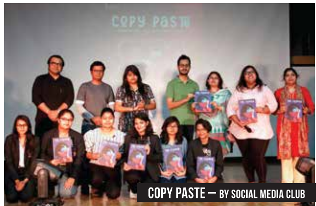
COPY PASTE — BY SOCIAL MEDIA CLUB