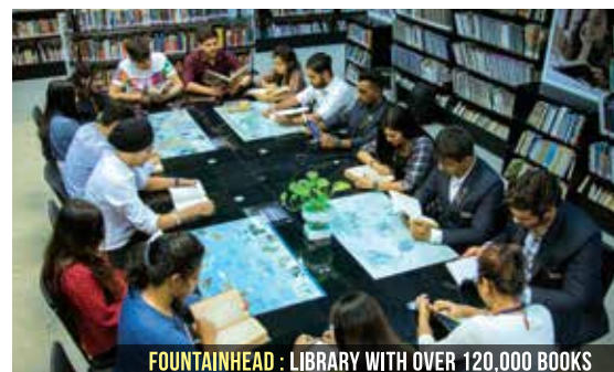
FOUNTAINHEAD : LIBRARY WITH OVER 120,000 BOOKS