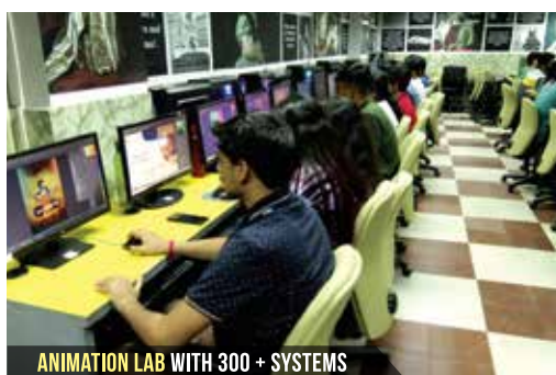
ANIMATION LAB WITH 300+ SYSTEMS