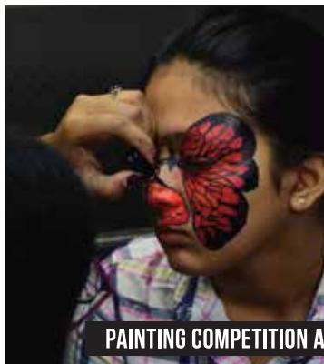
PAINTING COMPETITION AT MANAGEDIA — BY CULTURAL CLUB