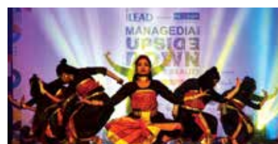
Cultural Program at Managedia