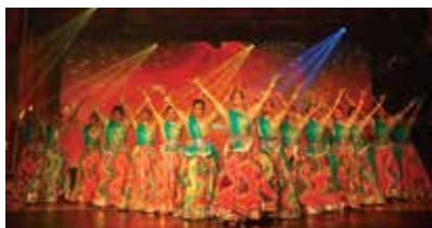
Annual Awards 2023