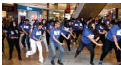
Flashmob by iLEAD Students