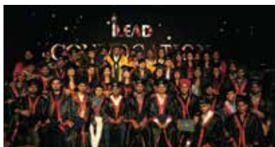
Convocation Ceremony 2023