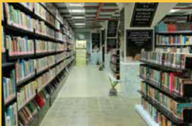
FOUNTAINHEAD : Library with over 1,20,000 Books