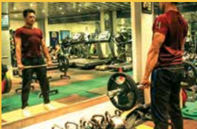
I FEEL FITNESS : The Fitness Studio