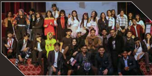
Fanime 2.0 Organised by Animation Club