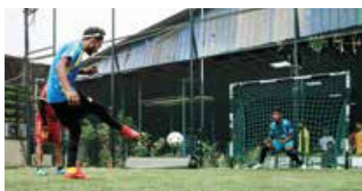
Sports Event at Managedia