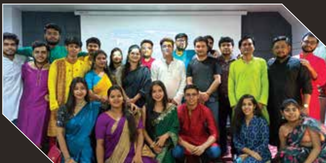
Art and Craft Exhibition at iLEAD