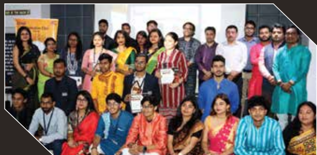
Binaswari 2023, An Art Exhibition Organised by Animation Club