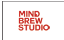
Mind Brew Studio