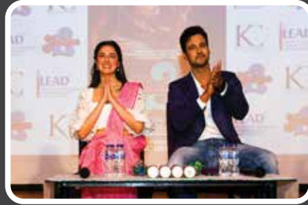
Divya Khosla Kumar and Yash Dasgupta