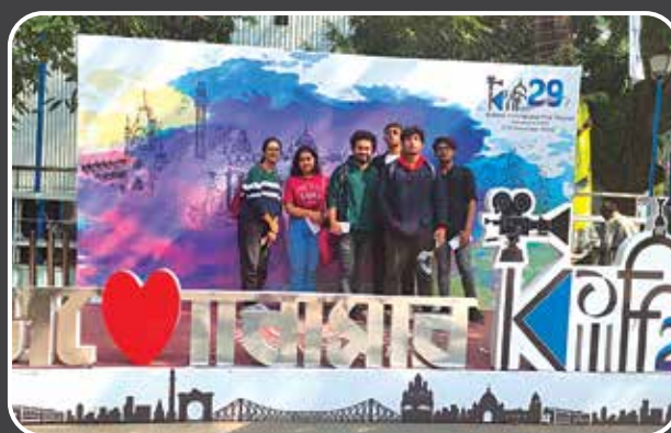
Visit to Kolkata International Film Festival 2024