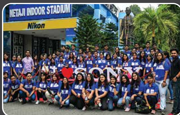
Visit to Netaji Indoor Stadium- Image Craft Expo