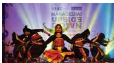
CULTURAL PROGRAM AT MANAGEDIA