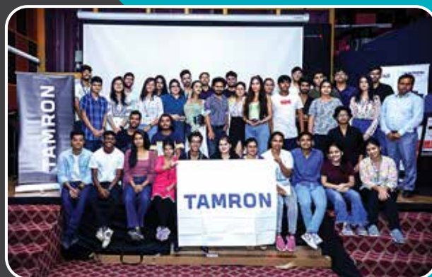
Fashion Portrait Workshop in Association with Tamron India