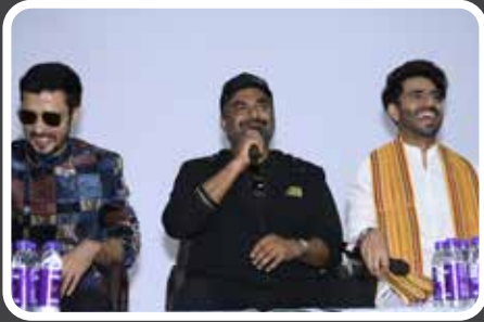
Darshan Kumar, R. Madhavan and Aparshakti Khurana