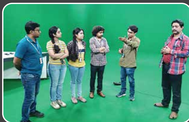
Visit to TV9 Studio