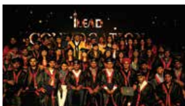
CONVOCATION CEREMONY 2023