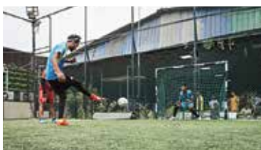
SPORTS EVENT AT MANAGEDIA