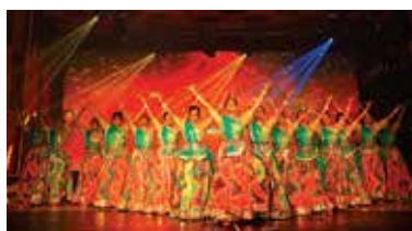
ANNUAL AWARD 2023