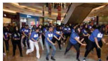
FLASHMOB BY ILEAD STUDENTS