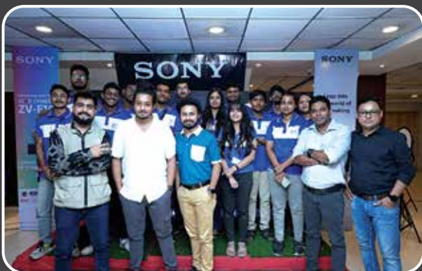
Storytelling Workshop in Association with Sony India