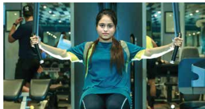
I FEEL FITNESS (GYM)