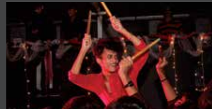
Dandiya Night 2023