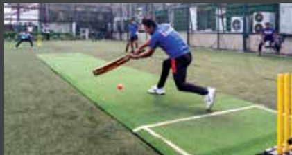
Cricket Tournament 2023