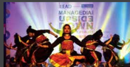
Cultural Program at Managedia