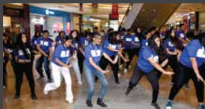
Flashmob by iLEAD Students