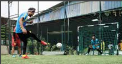
Sports Event at Managedia