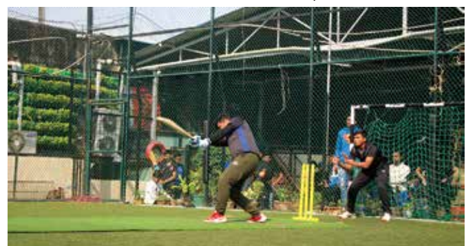
ROOFTOP PLAY GROUND