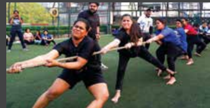
Fitness Event 2023