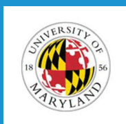
COLVIN INSTITUTE, UNIVERSITY OF MARYLAND

iLEAD also has collaborations with 16+ international universities including the Colvin Institute of Real Estate Development, USA. We have signed MOUs (Memorandum of Understanding) with numerous institutes and universities from around the world.