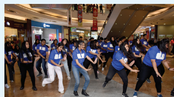
FLASHMOB BY ILEAD STUDENTS

113J, Matheswartola Road, Topsia, Near Vishwakarma Building, Kolkata 700046 P : +91.33.40182000/02 M : +91.91631 55555 E : info@ilead.net.in W : www.ilead.net.in