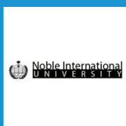
NOBLE INSTITUTION TORONTO, CANADA