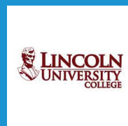
LINCOLN UNIVERSITY COLLEGE, MALAYSIA