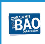
CORPORATE UNIVERSITY GERMANY