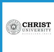
CHRIST UNIVERSITY BANGALORE, INDIA