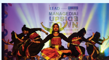
CULTURAL PROGRAM AT MANAGEDIA