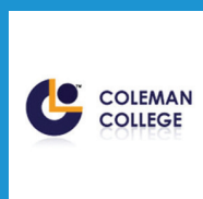
COLEMAN COLLEGE SINGAPORE