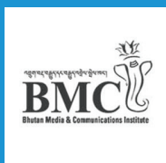
BHUTAN MEDIA & COMMUNICATIONS INSTITUTE THIMPHU, BHUTAN