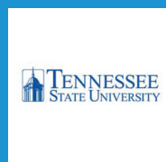
TENNESSEE STATE UNIVERSITY, NASHVILLE, USA