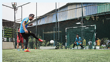
SPORTS EVENT AT MANAGEDIA