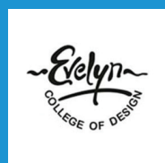
EVELYN COLLEGE OF DESIGN KENYA, AFRICA