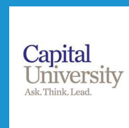
CAPITAL UNIVERSITY OHIO, USA