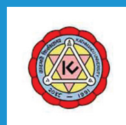
KATHMANDU UNIVERSITY NEPAL