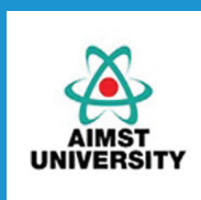
AIMST UNIVERSITY KEDAH, MALAYSIA