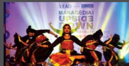
Cultural Program at Managedia