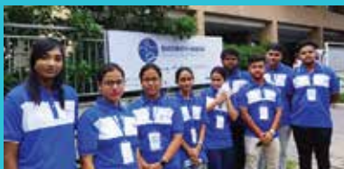
Industry Visit - Bhagirathi Neotia Hospital