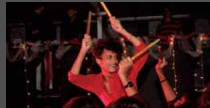
Dandiya Night 2023