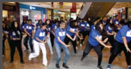
Flashmob by iLEAD Students