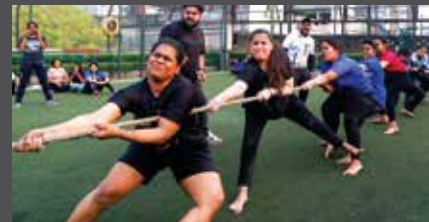
Fitness Event 2023