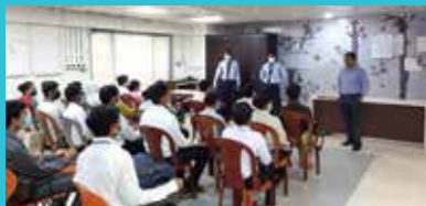
Seminar at Ruby General Hospital