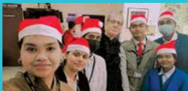
Celebrating Christmas with Paediatric Cancer Patients