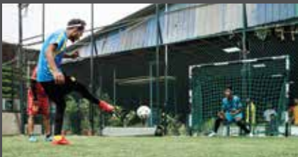
Sports Event at Managedia