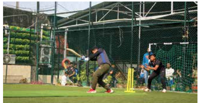
ROOFTOP PLAY GROUND