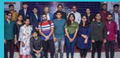
Future Vista - Session on Healthcare Industry