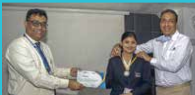
Seminar by Ruby General Hospital at iLEAD