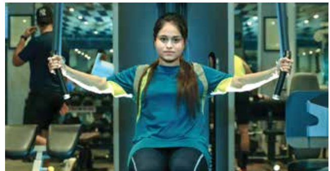
I FEEL FITNESS (GYM)