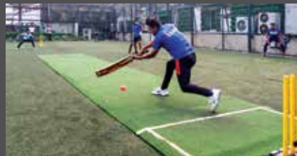
Cricket Tournament 2023