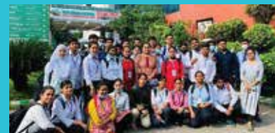
Industry Visit - Ruby General Hospital