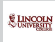
LINCOLN UNIVERSITY COLLEGE, MALAYSIA