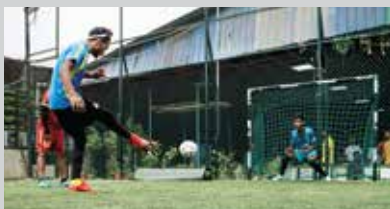
Sports Event at Managedia