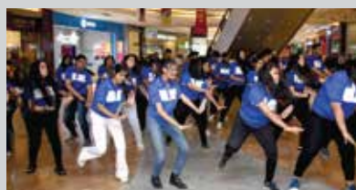
Flashmob by iLEAD Students