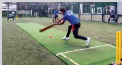
Cricket Tournament 2023