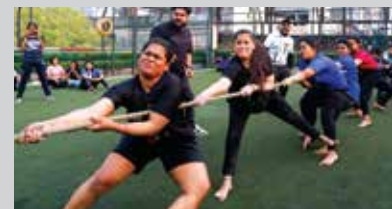
Fitness Event 2023