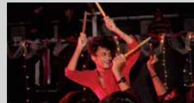
Dandiya Night 2023