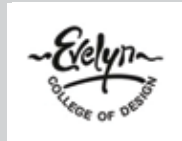
EVELYN COLLEGE OF DESIGN KENYA, AFRICA