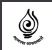
JAIN VISHVA BHARATI INSTITUTE LADNUN, RAJASTHAN