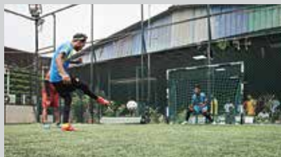
SPORTS EVENT AT MANAGEDIA