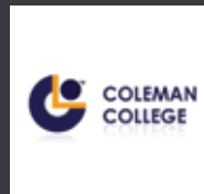
COLEMAN COLLEGE SINGAPORE