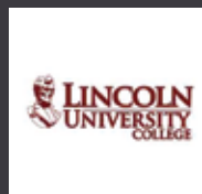
LINCOLN UNIVERSITY COLLEGE, MALAYSIA