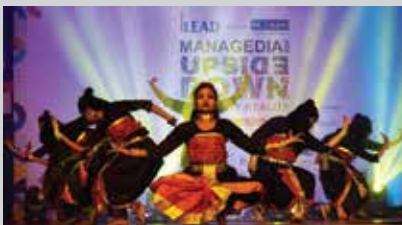
CULTURAL PROGRAM AT MANAGEDIA