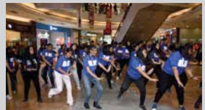
FLASHMOB BY ILEAD STUDENTS