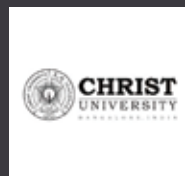
CHRIST UNIVERSITY BANGALORE, INDIA